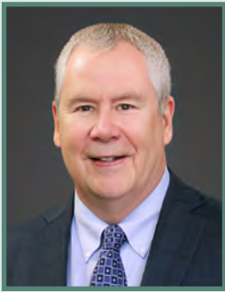
By Steve Jacobs

Despite 2023's YTD decrease in deal volumes compared to the second half of 2022, M&A activity continues to exceed pre-pandemic levels. As companies pursue strategic growth or repositioning with select divestitures, M&A activity for the remainder of 2023 and 2024 will offer a reasonable level of middle market transactions. There are many corporations rich with cash and ready to make acquisitions, and we believe middle market transactions will be what leads activity in the last quarter of 2023 and